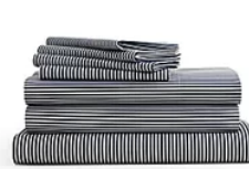
These Sheets Are One Of The Best Purchases I've... Brooklinen