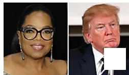
Oprah responds to Trump's 'insecure' comment