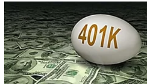
Will my 401K Lead to an Early Retirement? Faqo