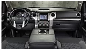
A Car Like No Other: The New 2018 Toyota Tundra Explored Edmunds