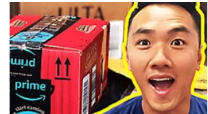
You Already Pay for Amazon Prime - Here's How You... Honey